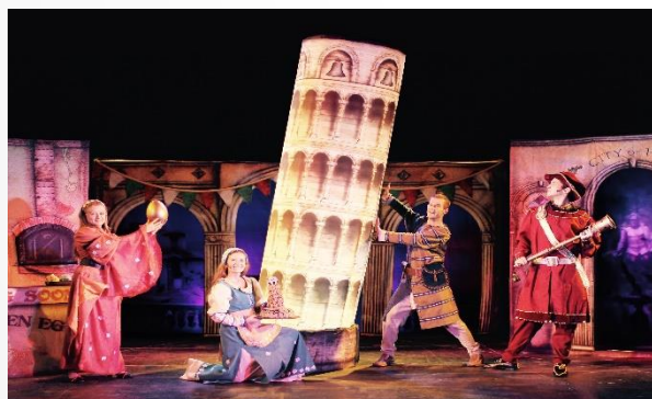
The Tower - 2014