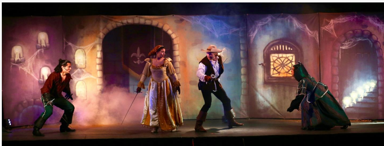
D'ARTAGNAN - 2016

With deep roots in educational theatre and ELT (English Language Teaching), ArtSpot creates and performs original works and adapted classics for young audiences around the world, combining musical theatre, physical comedy, and meaningful stories in its own fresh and distinctive way.