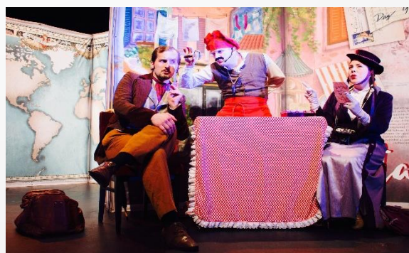
Around the World in 80 days - 2017