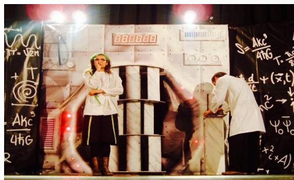
The Time Machine - 2012