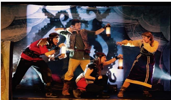
FREYA, A Viking Story - 2015