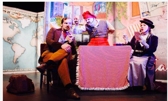
Around the World in 80 days - 2017