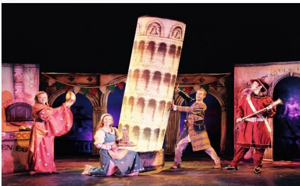
The Tower - 2014