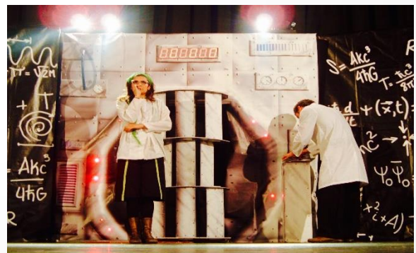
The Time Machine - 2012