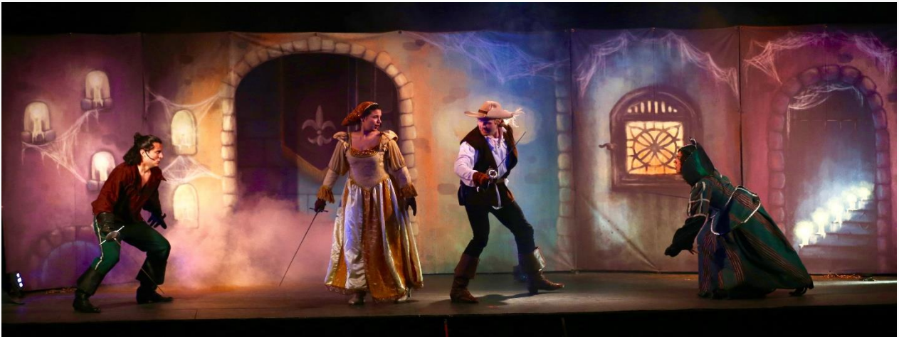
D'ARTAGNAN - 2016

With deep roots in educational theatre and ELT (English Language Teaching) , ArtSpot creates and performs original works and adapted classics for young audiences around the world, combining musical theatre, physical comedy, and meaningful stories in its own fresh and distinctive way.