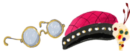
GLASSES AND HAT