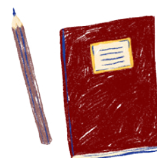
PENCIL AND NOTEBOOK