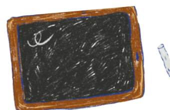
BOARD AND PIECE OF CHALK